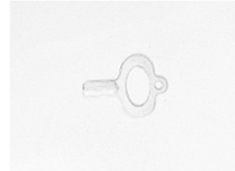
Key x 2