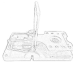
Snap Trap Rat x 2