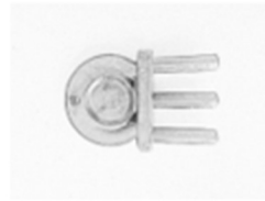
Station Key x 1