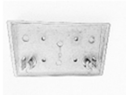
Mounting Bracket x 1