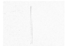
Vertical Rod x 4