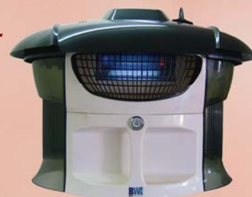
The Mosquito SlayerPRO