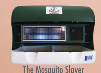
The Mosquito Slayer