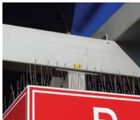
The top of this sign is effectively protected with the Dura-Spike. Multiple rows ensure the entire surface is bird proofed.