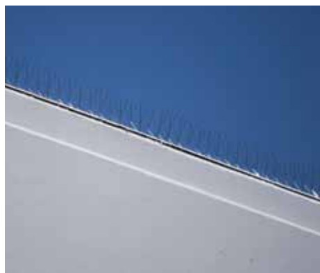
From the ground it is almost impossible to see the Dura-Spike that is protecting this building.