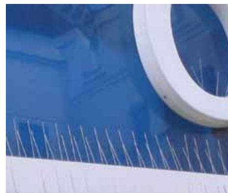
Visible up close, but invisible from the distance, Dura-Spike protects this ledge and the sign letters from pigeons.